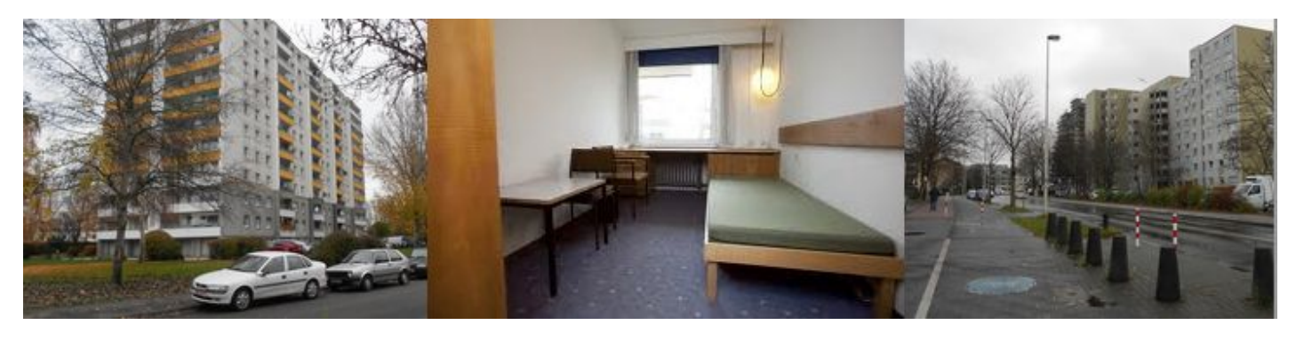
Figure 3: Image of deprived housing conditions

The header associated with deprived housing conditions consisted of tower blocks and a grey street view in Tannenbusch, a very unpopular part of the city, and a sparsely furnished interior (see figure 3).