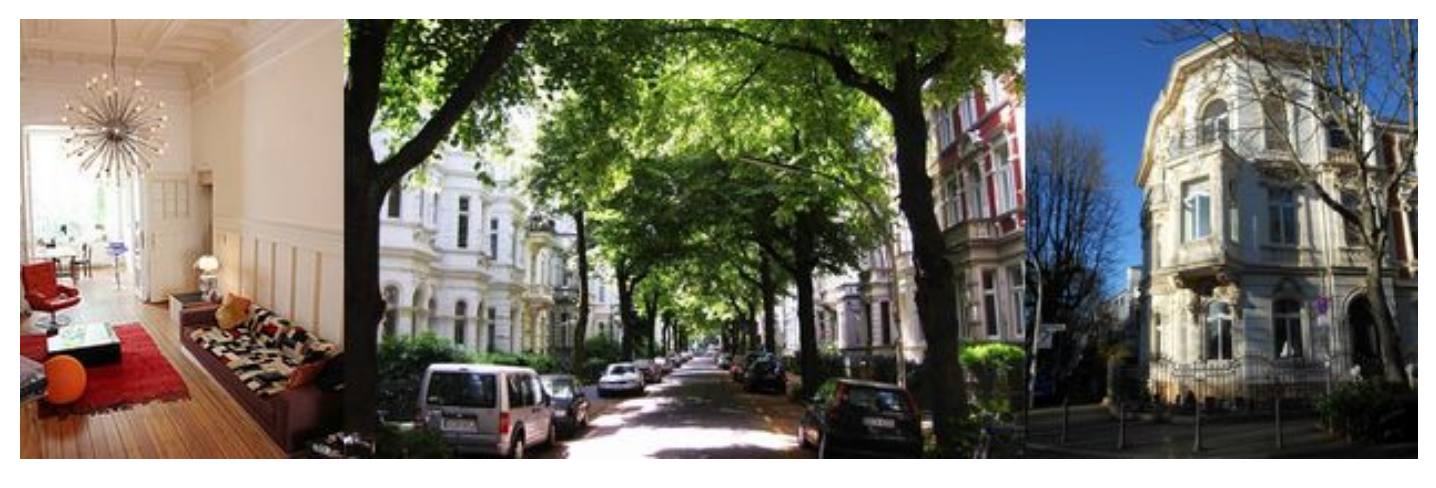
Figure 1: Image of upscale housing conditions

The option "upscale" depicted a street and a mansion in an elegant residential area as well as a spacious interior with stucco ornamentation and designer furniture (see figure 1).