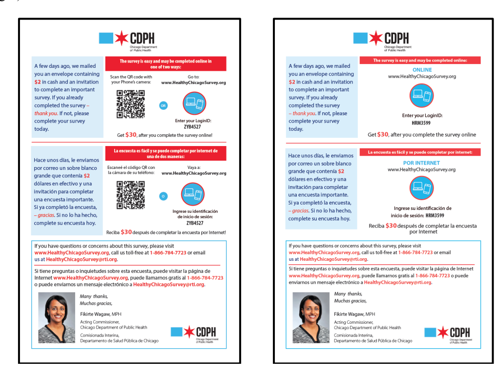
Figure A.2 : Example of 2023 HCS First Reminder Self-Mailer with a QR Code (left) and without a QR Code (right).